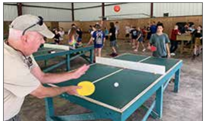
Right: A time of fun and games.