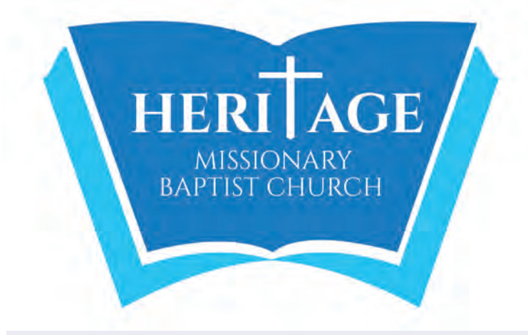
Heritage MBC is located at 5580 Barksdale Blvd, Bossier City, Louisiana 71112.

Thank you for your faithful support to this annual fundraiser for our seminary. Your investment in our school is an investment in the future of your church. Until the Lord returns, the students of today will be the pastors of tomorrow.