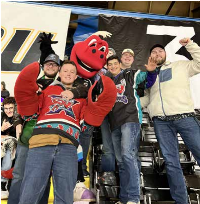
Some of the students of LMBIS attended a hockey game in Shreveport prior to the start of the new semester. They joined in cheering for the Shreveport Mudbugs in the team's victory for the night. Fellowship is a big part of the LMBIS experience.

Bookstore: 318-371-1111 School: 318-377-5780 info@lmbis.com www.lmbis.org facebook.com/lmbisminden