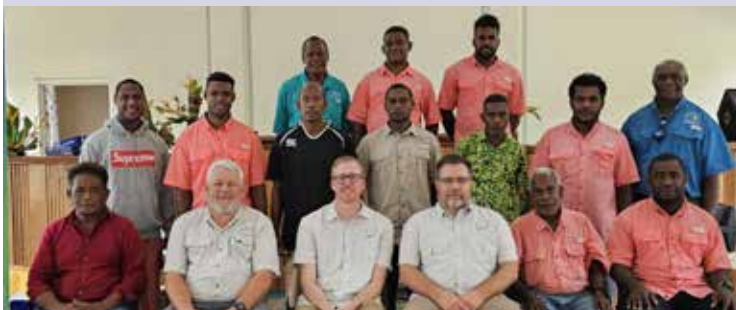
January 2024 SIMBSS Class