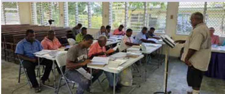
Old Testament Survey lesson being taught by a recent graduate.