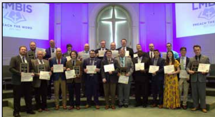
All Students present for graduation.

Scholarships were also awarded to eleven students for the 2024-2025 school year. These scholarships are memorial scholarships set up by families of loved ones who have been associated with LMBIS. The announcement of these scholarships is a reminder of the impact and influence of those who served before us.