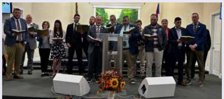
Students, Faculty, and Alumni bring the Thursday Evening Special.